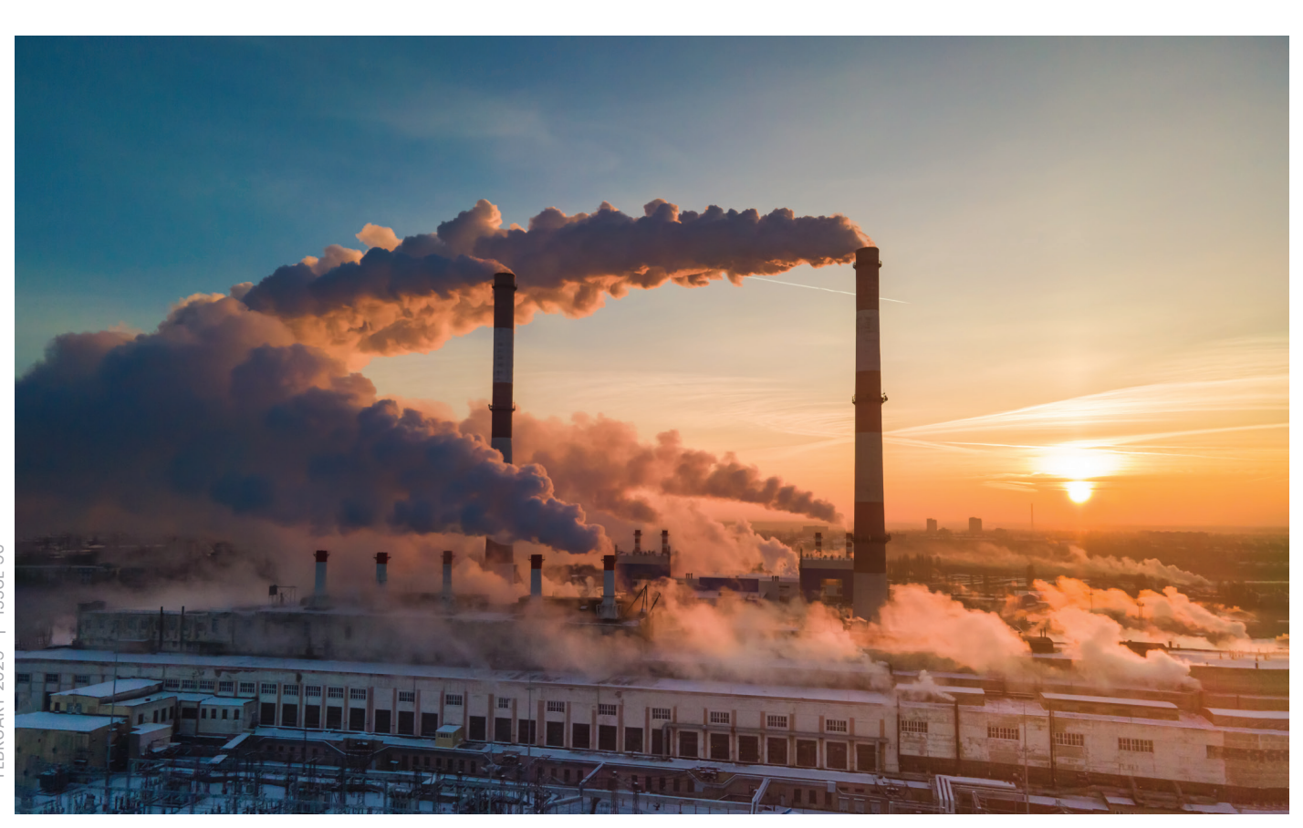
FEBRUARY 2025 | ISSUE 50